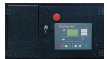
Deep Sea 7510 Loadshare Control Panel