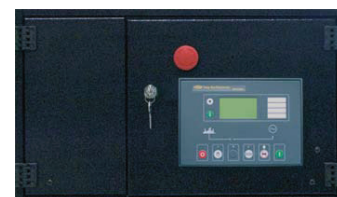
Deep Sea 7310 Control Panel