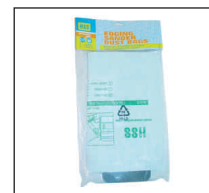
Edging Sander Dust Bag £2.35 Product code 15422