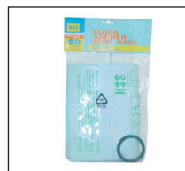
Floor Sander Dust Bag £1.31 Product code 15424