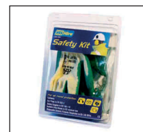
Safety Kit £5.46 Product code 11310