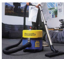
Light Duty Vacuum £28.04 per weekend Product code 58111/2