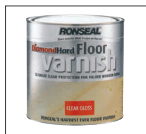
Floor varnish 2.5L £34.37 Product code 15561