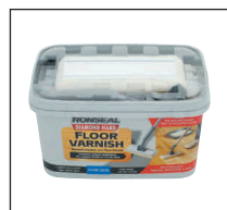
Floor Varnish Applicator £41.09 Product code 15565