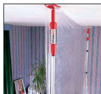
Dust Partition Sheets £2.30 Product code 11713