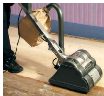
Floor Sanding Machine £53.19 per weekend Product code 05412