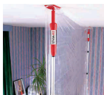
Portable Dust Partition £18.40 per week Product code 50930